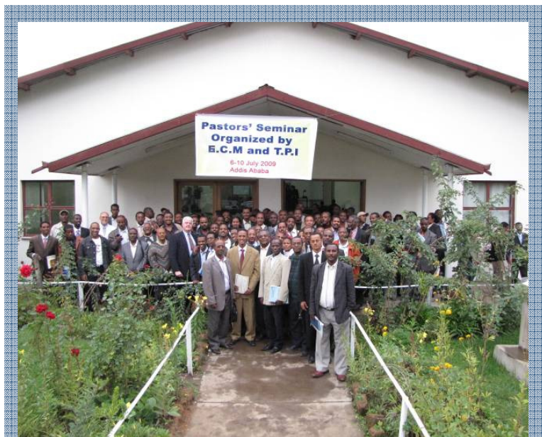
Participants gather at the TPI Addis Ababa, Ethiopia institute at one of the oldest training grounds in the whole country, which stood through many years of persecution.

Thank you for standing with us in prayer and giving funds to help us fulfill this great God-given and God-glorifying challenge to help these many needy African pastors who have nothing but a will to be trained in the Word of God and the Gospel of Jesus Christ.